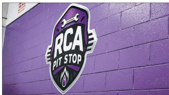
The Pit Stop is Rockdale Career Academy's new student enterprise for car maintenance.

employment on their way forward into adulthood.”